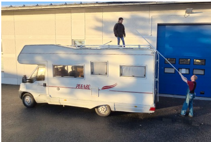
Light weight and easy to handle.

A 5 minute build and the structure is up. Light-weight system that also has plastic feet to further protect the roof it is standing on. Suitable for all vehicles and trailers that needs to be protected from the elements.