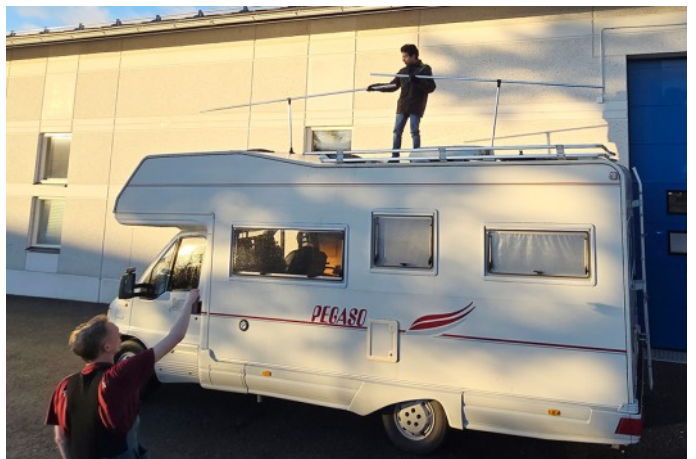
No tools are needed for connecting the parts.