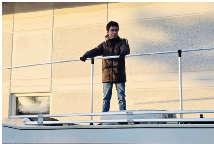
Can easily be mounted alone