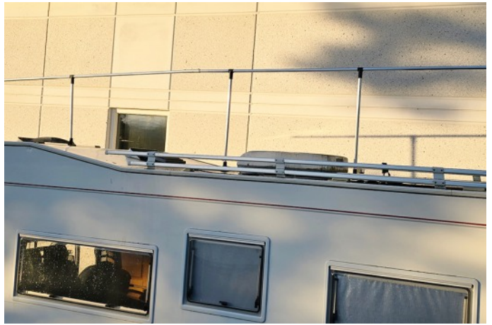
Standard model with 3 x T-BARS & Ridge Pipe